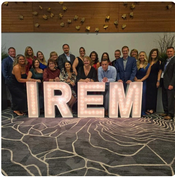
IREM Region 10 members from Iowa, Nebraska, Wichita, St. Louis, and Kansas City